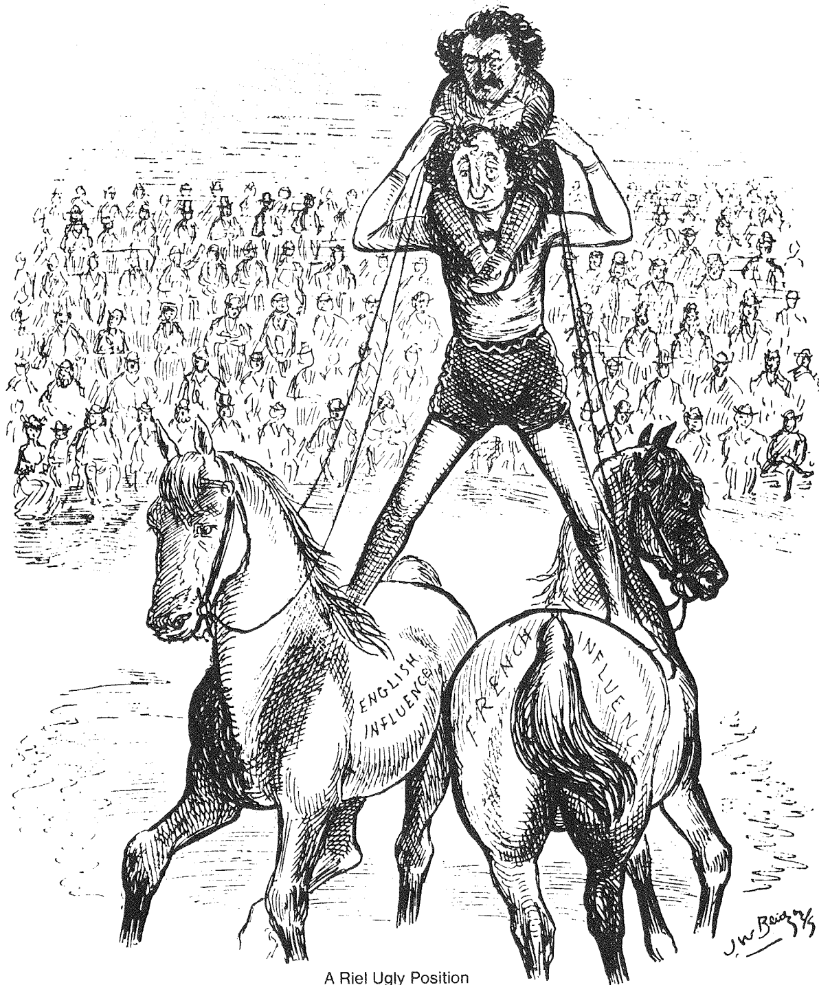
A Riel Ugly Position